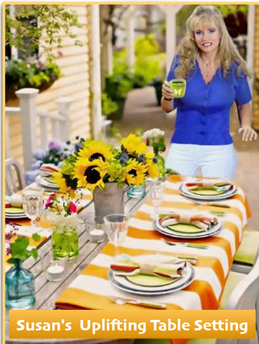
Susan's Uplifting Table Setting